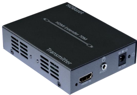
The sender A