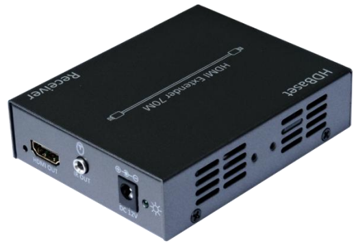
The receiver B