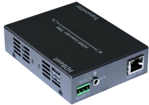
The sender B