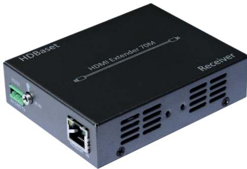
The receiver A