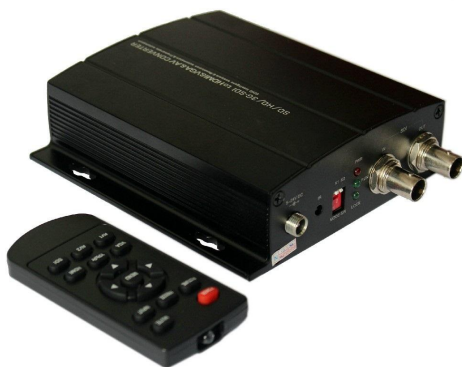
LM-SC5810P SDI to HDMI & VGA & AV converter